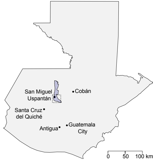
Figure 1: Map of Guatemala showing the municipality of Uspantán (dark grey). The speaker population of Uspanteko is concentrated in the area approximated by the dashed rectangle.

not be very surprising that Uspanteko has diverged significantly from the other languages of the K'ichean branch. The most striking innovations can be found in the system of word-level prosody. Uspanteko is notable as the only Mayan language in Guatemala to have developed a full-fledged system of contrastive lexical tone, as illustrated in (1) (examples from Can Pixabaj 2006).